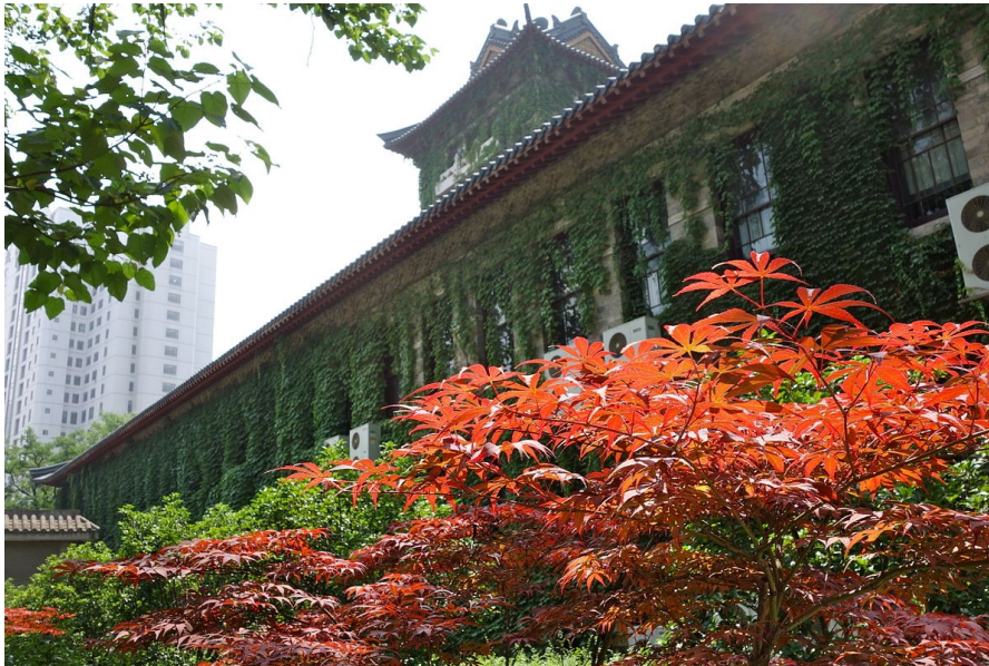
"Nanjing uni vegetation" by Kevin Dooley from Chander